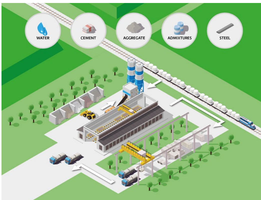
A scheme of manufacturing of the prefabricated filigree slabs by Pekabex BET S.A.