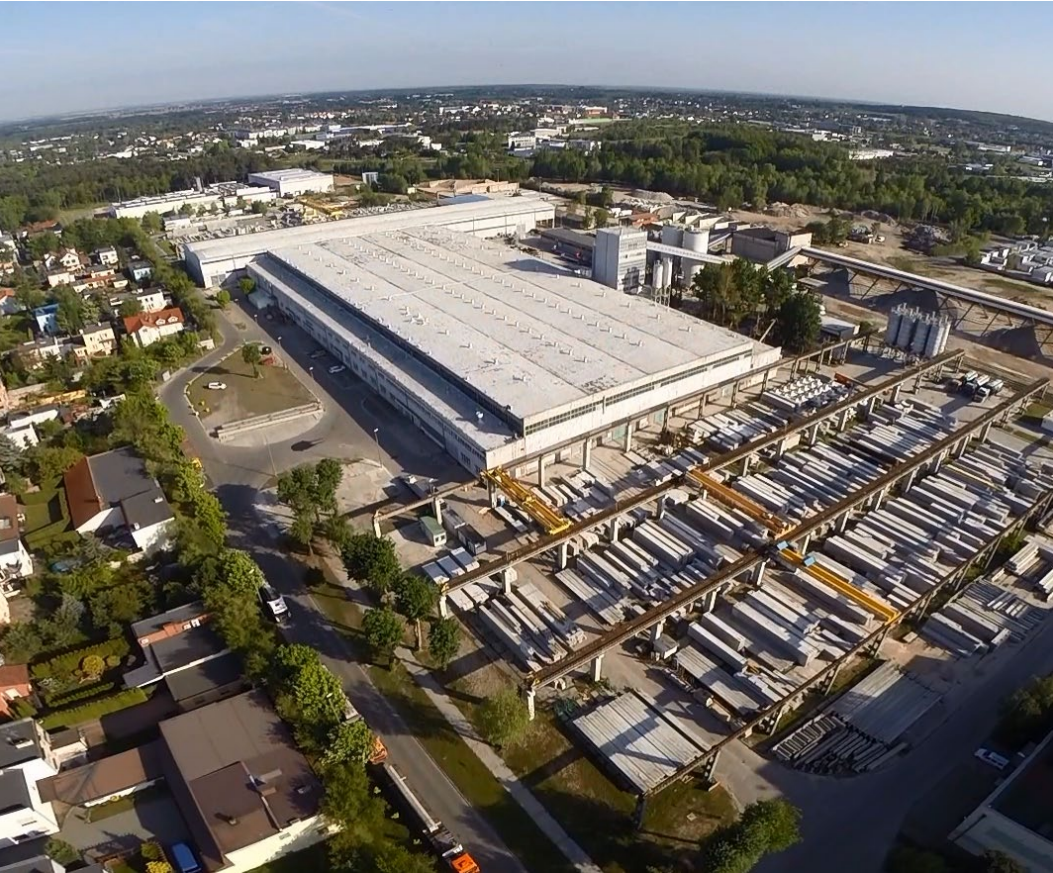
Fig 1. A view of Pekabex S.A. (Poland).

The company produces traditional reinforced elements, as well as modern prestressed elements used in enclosed structures (e.g. production and storage halls, offices, trade objects, railway stations, parking places), engineering objects (e.g. bridges, tunnels), and atypical designs. We offer wide range of standard products and realize special orders for individual designs. Pekabex S.A. possesses five production plants located in Poznań, Gdańsk, Bielsko-Biała, Mszczonów and Marktzeuln.